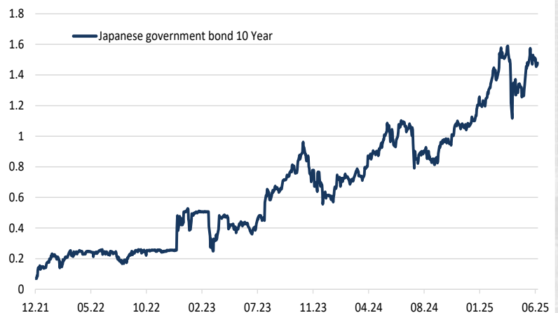
Ten-year government bond yields

Despite recent key rate hikes to 0.50%, the BoJ is now exercising heightened caution. Influenced by international economic slowdown risks from U.S. tariff policies, the central bank is prioritizing stability over a rapid return to its inflation target. A further rate increase is unlikely in the coming quarters, as the BoJ is caught between the need to support a fragile economic recovery and counter persistent inflationary pressures. The weakness of the yen also presents a concern, as it makes imports more expensive and fuels inflation. The central bank is navigating a delicate transition, aiming to consolidate the return of inflation to its 2% target in a sustainable manner.